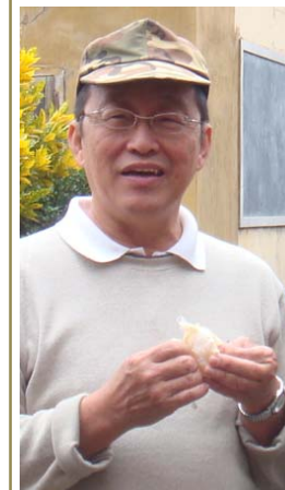
Bro Kooyi / Kooyi 弟兄